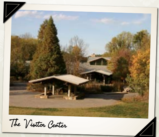
The Visitor Center