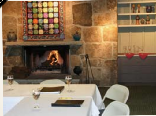
The Ijams Room