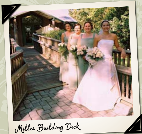
Miller Building Deck