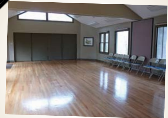
The Miller Building Interior

Call Kimberly Dmytro, (865) 577-4717, Ext. 23 for all the details!